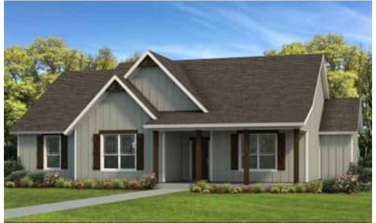
Elevation C | The Canyon