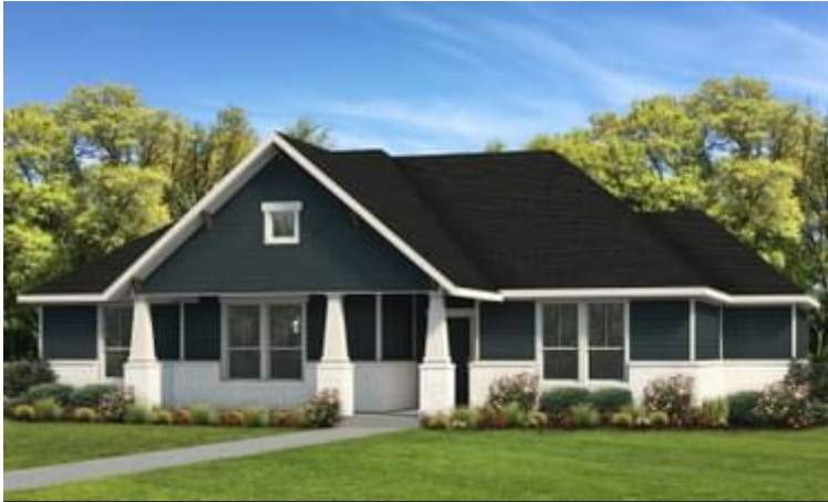
Elevation B | The Canyon