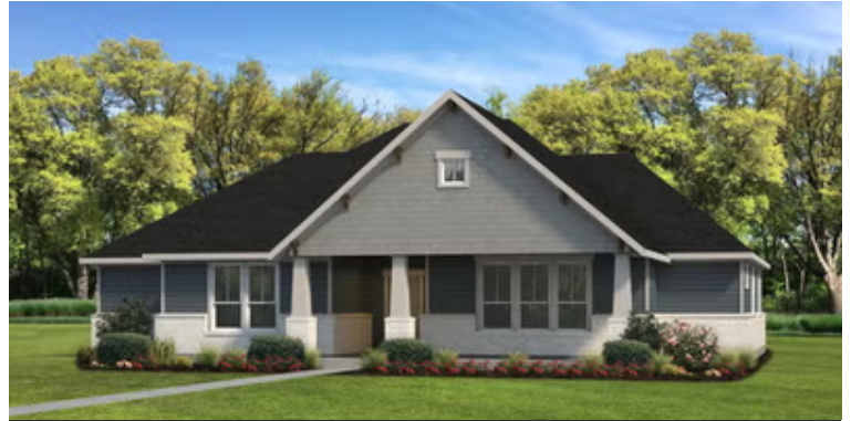
Brazoria B | Front Exterior