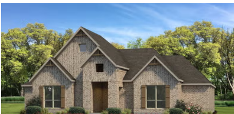
Brazoria E | Front Exterior