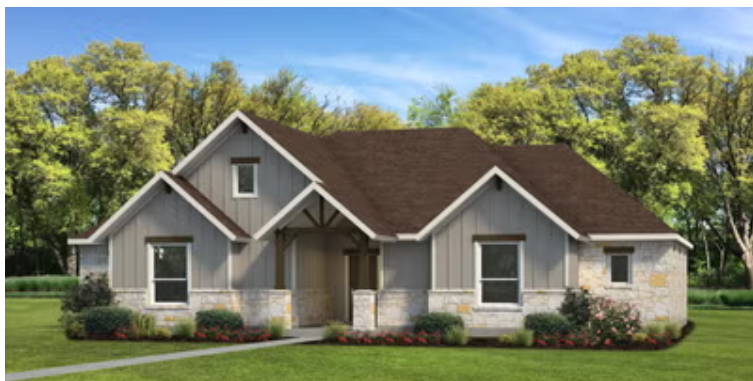
Brazoria D | Front Exterior