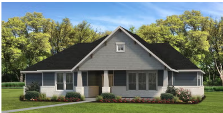
Brazoria B | Front Exterior