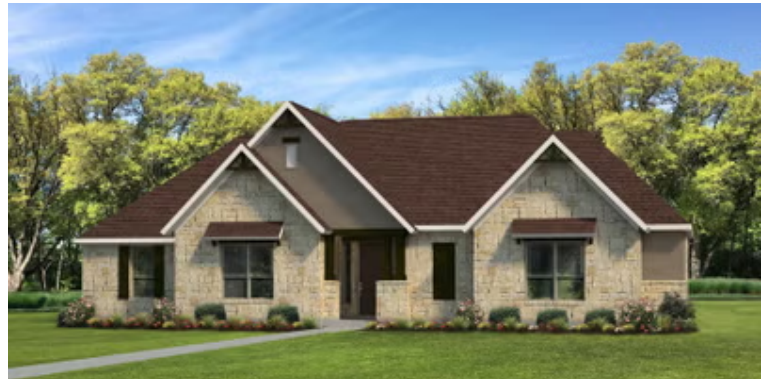
Elevation D | The Barton Springs