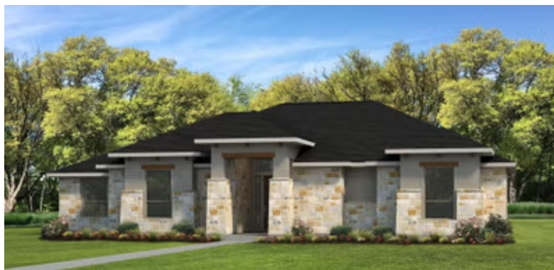
Elevation E | The Barton Springs