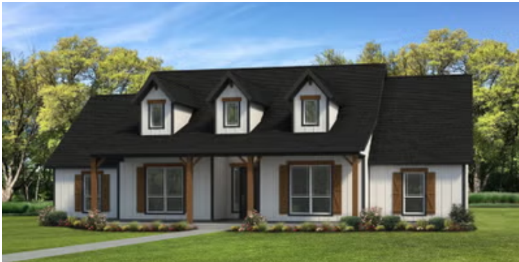
Elevation C | The Barton Springs