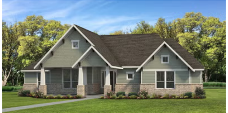
Elevation B | The Barton Springs