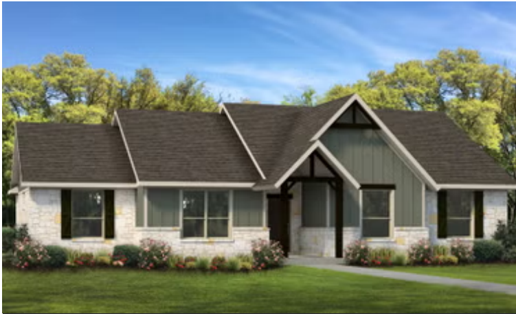
Elevation D | The Angelina