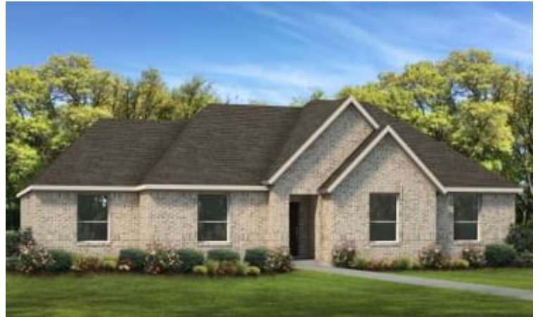
Elevation A | The Angelina