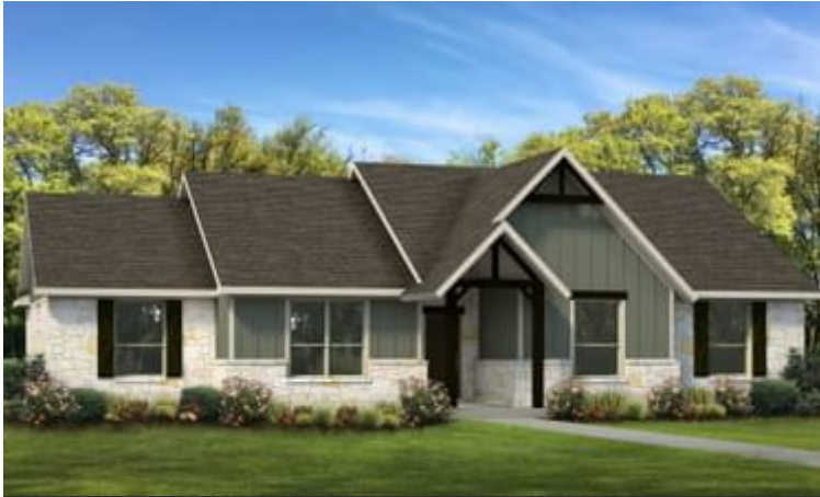
Elevation D | The Angelina