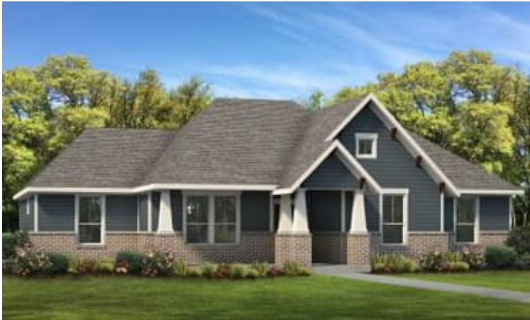
Elevation B | The Angelina