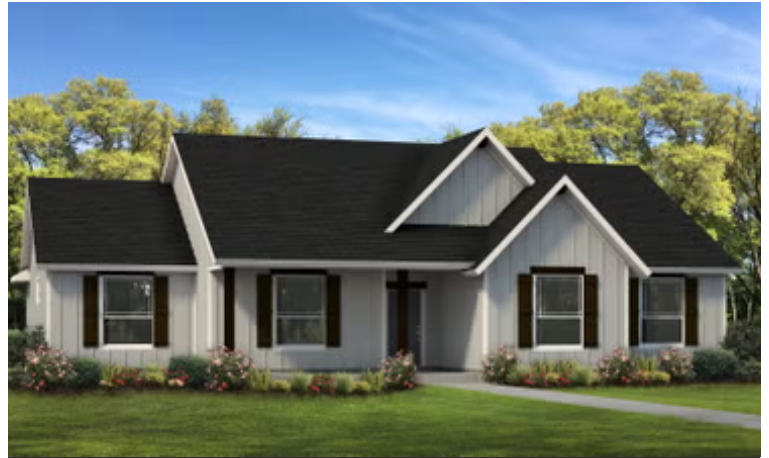
Elevation C | The Angelina