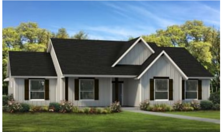
Elevation C | The Angelina