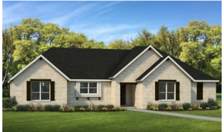
Elevation A | The Abilene