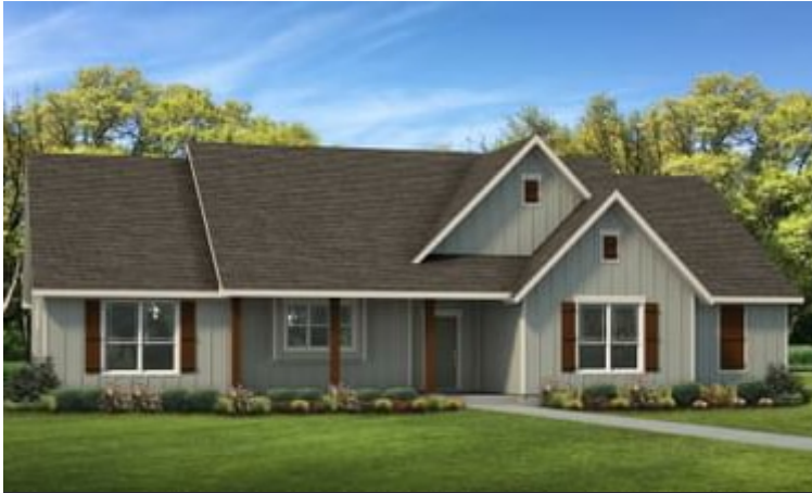
Elevation C | The Abilene